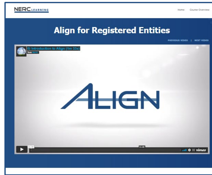
Figure 1.2: NERC Training Site

In addition to the training videos, the site contains comprehensive End-User and Start/Stop/Continue guides, all of which will be used during training. The End-User guides provide a detailed overview of how to navigate through Align Release 1 functionalities, while the Start/Stop/Continue guides provide detailed guidance on which activities move to Align and which activities stay inside the legacy systems.